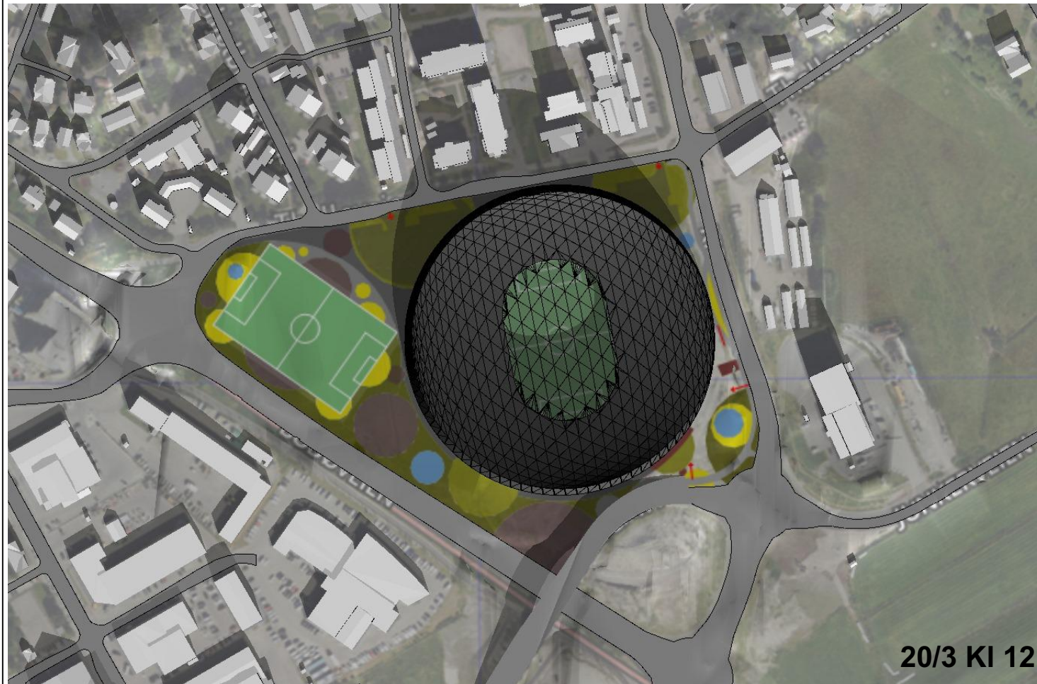
20/3 KI 12